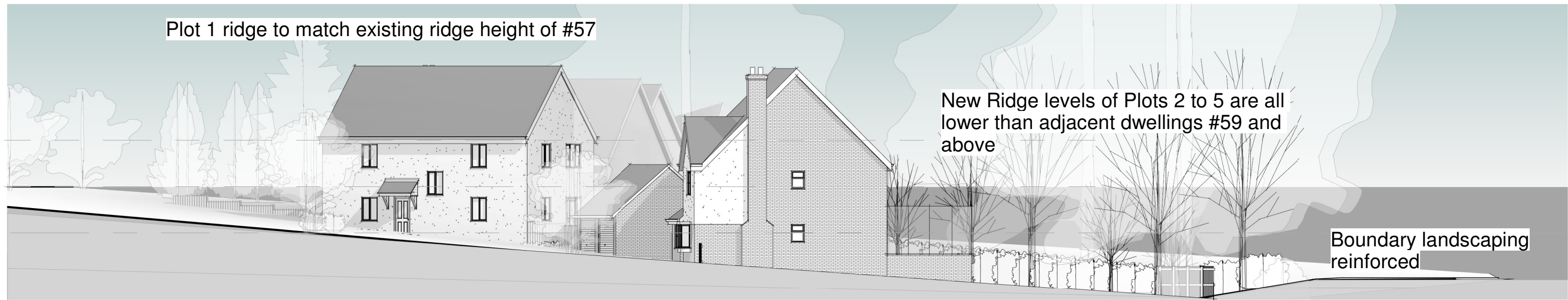
2 Long Section through site showing Plots 1 and 2 1 : 200