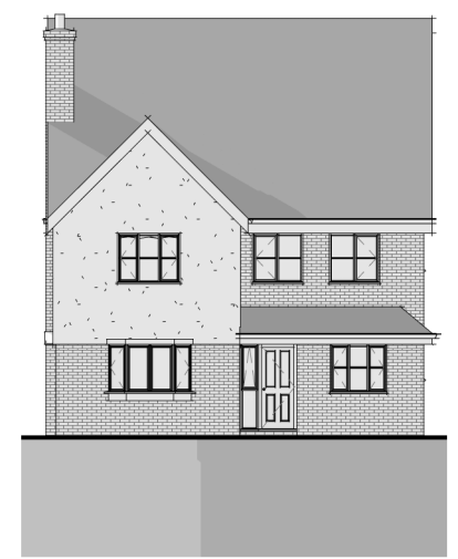
1 P 5 Front 1 : 200

Notes All dimensions to be checked on site. For drawing scales please refer to scale blocks All dimensions and levels are to be checked on site prior to commencement of any works. The contractor is to locate all existing serviced which may be affected by the works and where necessary maintain temporary diversions and protect such existing services. THIS DRAWING IS THE COPYRIGHT OF FARRIS ASSOCIATES LTD AND MUST NOT BE USED IN CONJUNCTION WITH ANY OTHER PROJECT WITHOUT WRITTEN CONSENT