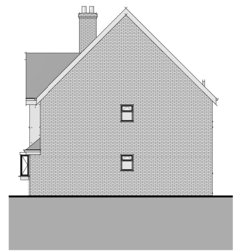
4 P 5 East 1 : 200