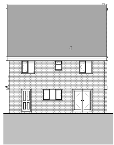
3 P 5 Rear 1 : 200