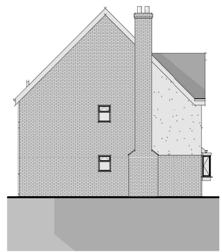
2 P 5 West 1 : 200