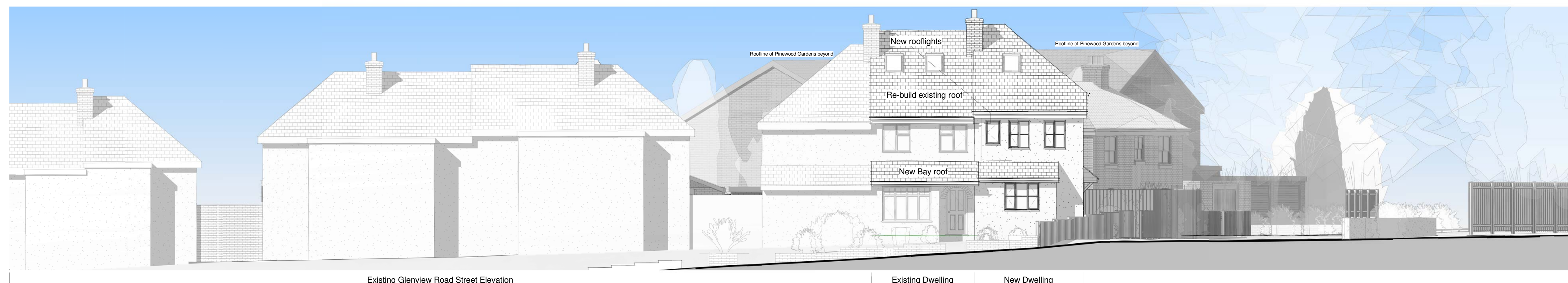
2 North Elevation (Proposed) 1 : 100