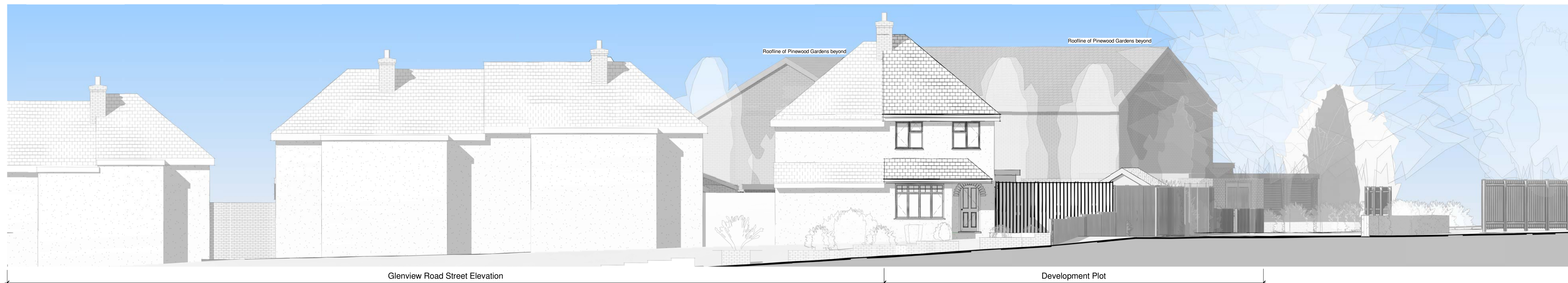
1 North Elevation (Existing) 1 : 100

Farris Associates Ltd Design, Building and Planning Consultants T: 01442 390098 E: farris.associates@icloud.com