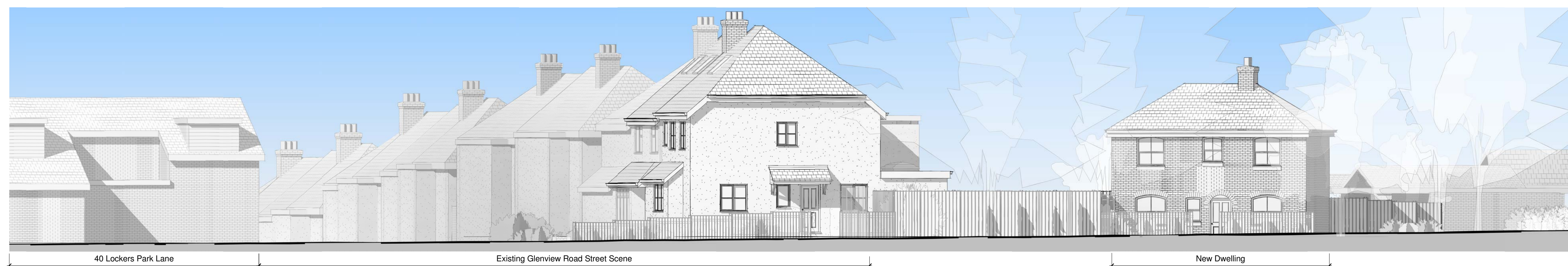
3 West Elevation A (Proposed) 1 : 100