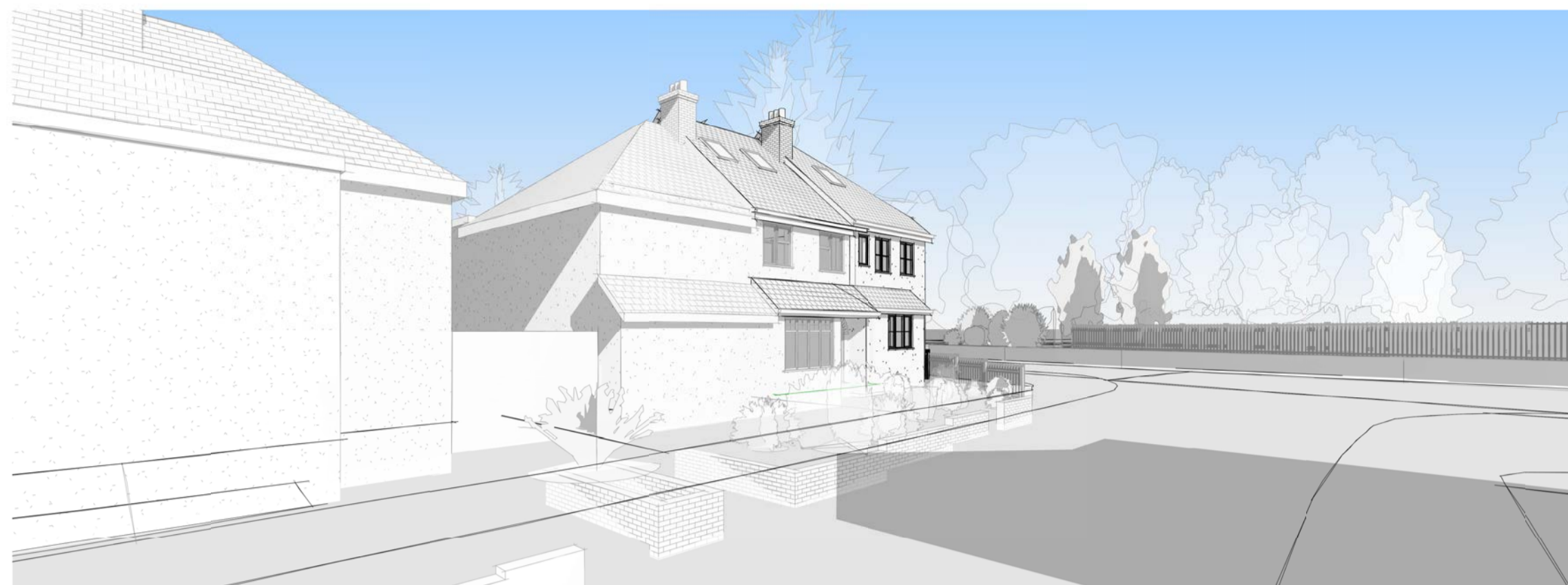
1 3D View Street View Terraced

Farris Associates Ltd Design, Building and Planning Consultants T: 01442 390098 E: farris.associates@icloud.com