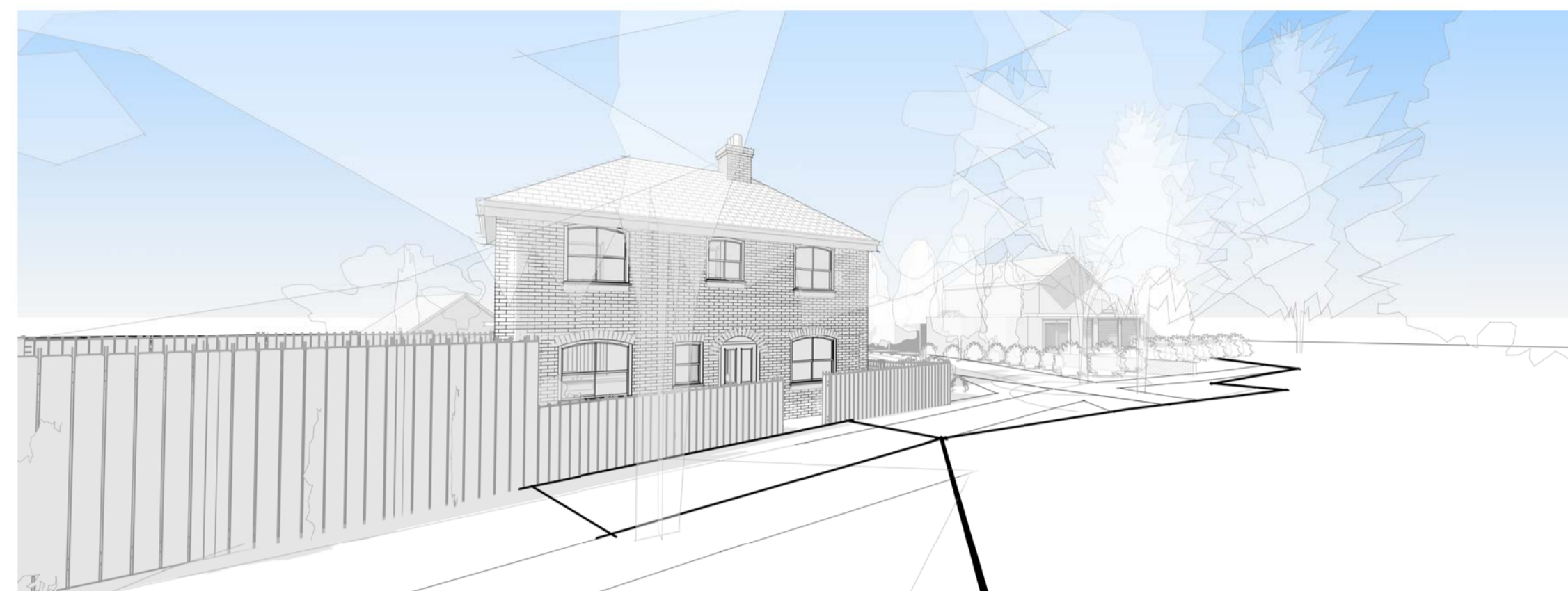
2 3D Street View Detached