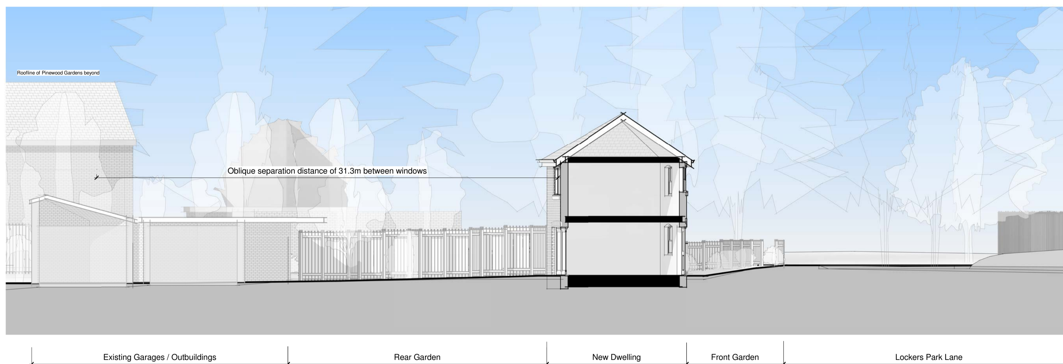
3 Site Cross Section 1 : 100