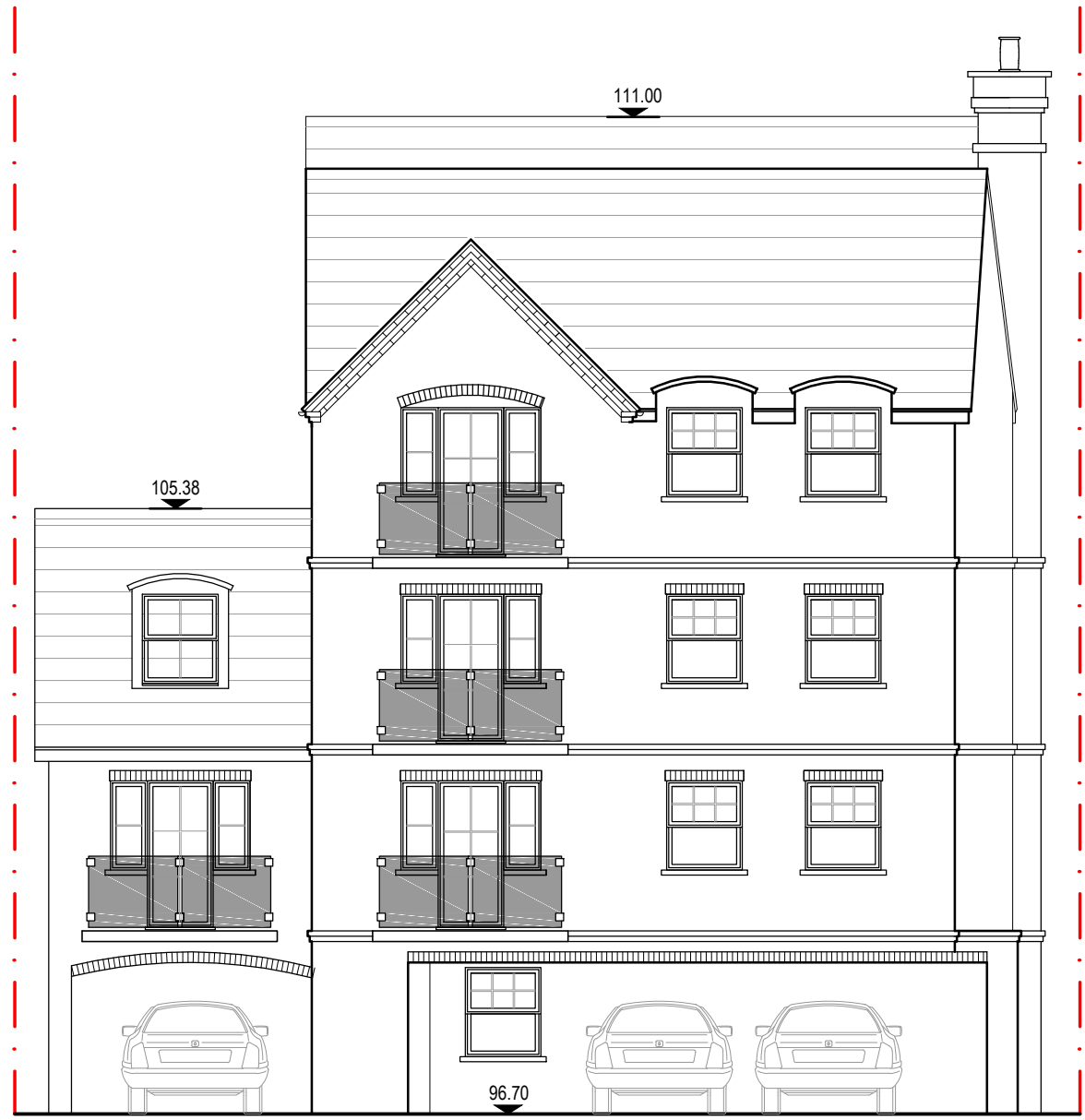
Proposed Rear Elevation 1:100