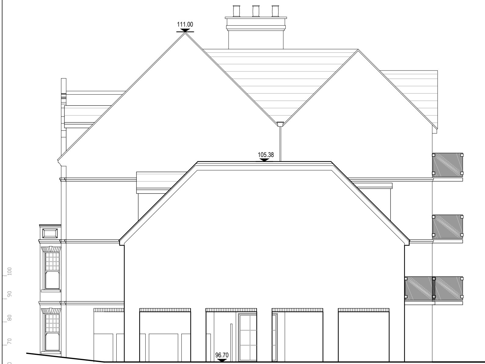
Proposed Side Elevation 1:100

MATERIALS: Walls: Orange face-brick Roof: Grey clay roof tiles with terracotta ridges, dark uPVC bargeboards to gable ends Windows: White uPVC with stone cill & splayed brick arch with stone keystone Guttering: black uPVC Ornamental work: Terracotta Panels to match existing