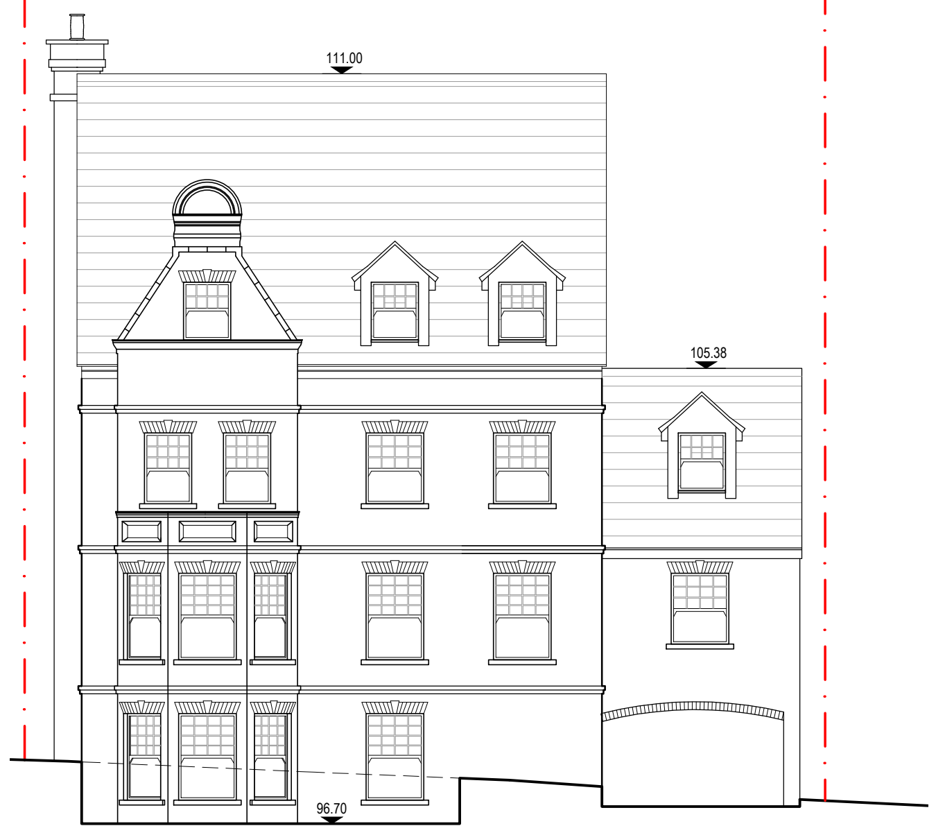
Proposed Front Elevation 1:100